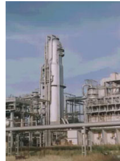
Chemical and Petrochemical