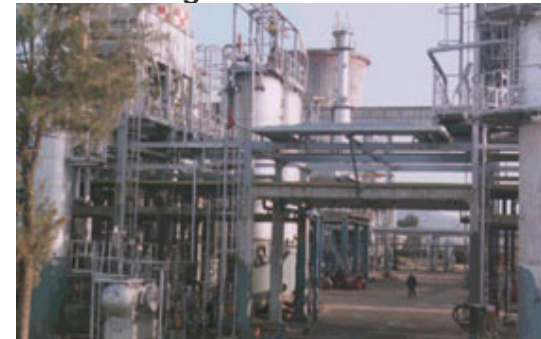
Sugar and Alcohol

Begins from the first touches until full-package delivery on Turnkey projects.