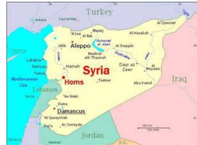
Syrian Arab Republic